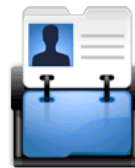
User Account Management