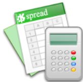
Finance & Accounting